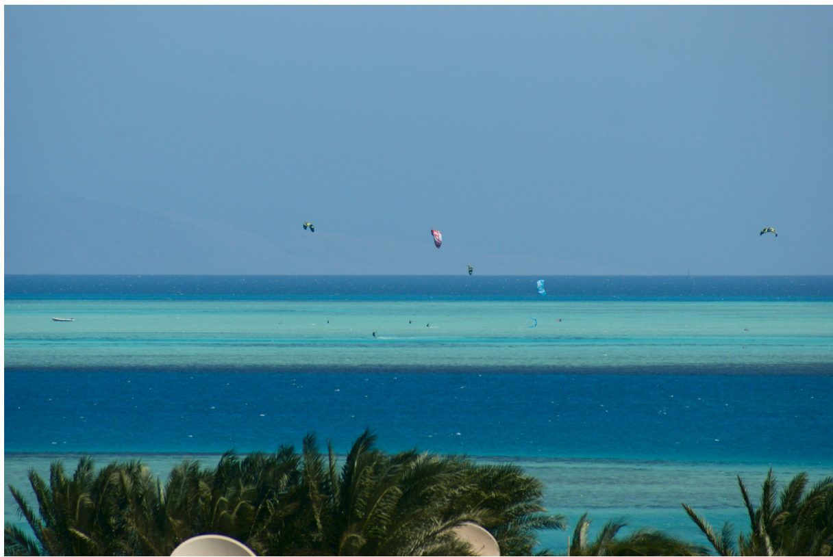
-view on the teaching spot from the hotel (rooms 900 – 912)